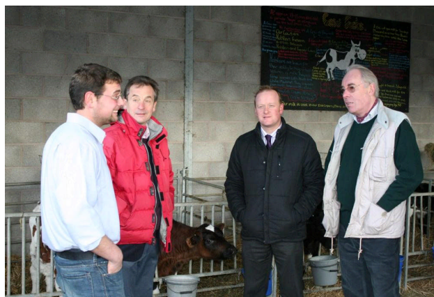
With Dairy Farmers

All NW MEPs were invited to a meeting with the regional NFU recently but only I and a Liberal turned up, to be briefed on the state of the milk market by various dairy farmers. They are having increasing difficulties with a milk price from the processors/supermarkets which does not provide much in the way of profit - if anything - and contracts which prevent them from selling surplus milk on the open market. The EU is proposing to loosen the terms of these present contracts between farmers and processors, thereby helping the dairy industry but probably raising the price of milk in the supermarket. I am clearly on the side of farmers. They deserve better treatment from us, the customers, and if that means a penny or two more on a bottle then so be it.