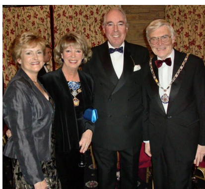
With the Chairman of the County Council