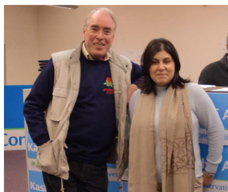
With the Party Chairman at Oldham