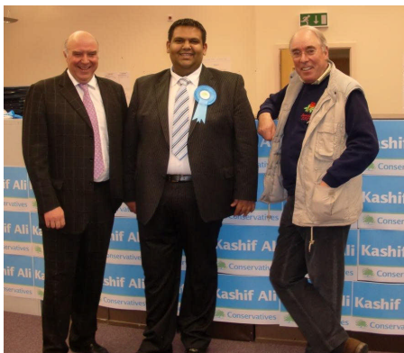
Oldham E & S

I happen to believe that the result of the Oldham By-Election was a good one for the Government - if not for our Conservative candidate. He worked as hard as at the General Election but circumstances have changed. It is quite clear that many Oldham Conservatives like what they are seeing of the coalition and felt that the best way to support it was by transferring their allegiance to the Liberal who had been expected to lose badly - and then didn't. Not ideal for us as a party of course, but good for the Government of which we are the largest part. A period of silence from some backbench Tory MPs would be helpful as well.