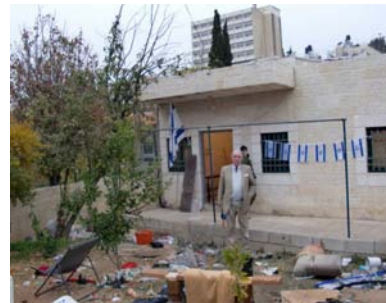
Israeli occupation of a Palestinian home (note the wrecked belongings thrown out)