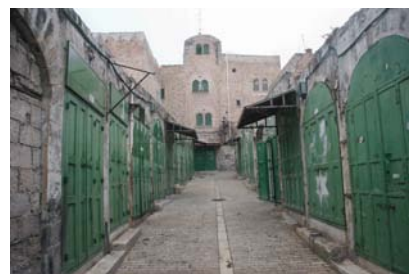
Closed! By order of the Occupying Power