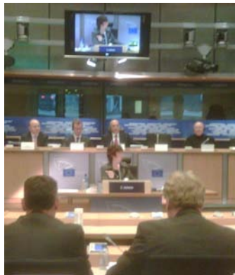
Baroness Ashton performs

The hearings into the suitability of potential Commissioners have been in progress over the last fortnight and the first was Baroness Ashton, who has been appointed the EU's Foreign Minister under the terms of the Lisbon Treaty. Frankly, all I could give her was a mere "pass" as she evaded all the complex questions and was just adequate on the fundamentals. She may yet struggle to be approved by a majority of MEPs and, as at least one candidate has withdrawn due to failing her inquisition, Lady Ashton is not certain of her post just yet.