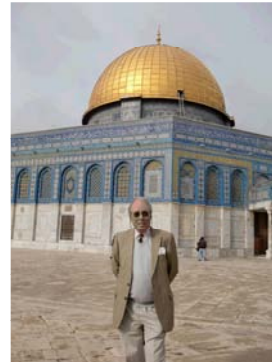
The Mosque of the Dome of the Rock

And as for Gaza... I was told by the Swedish Ambassador (then representing the EU Presidency) that we were barred from going there because the Israeli authorities did not want independent politicians to see the carnage and squalor that their actions had produced.